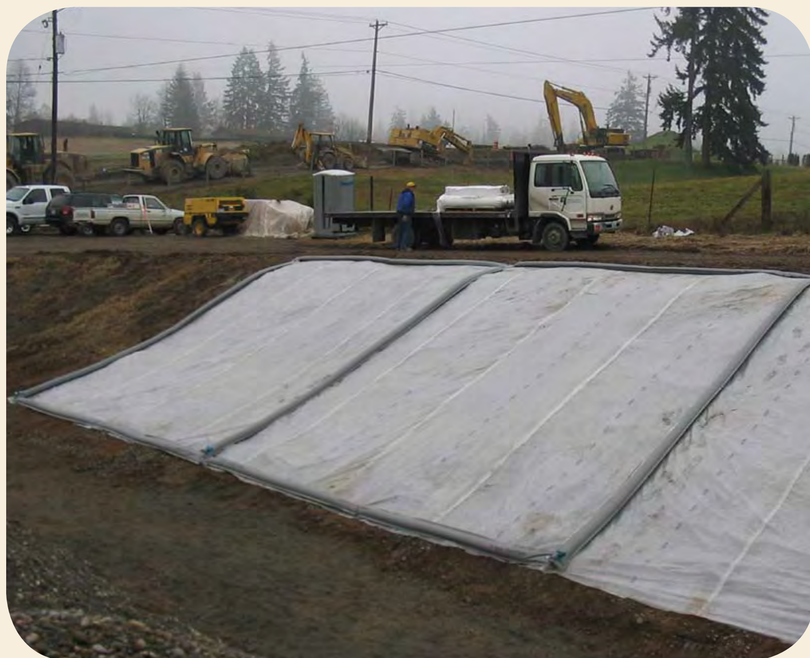
Hillside Covering for Erosion Protection