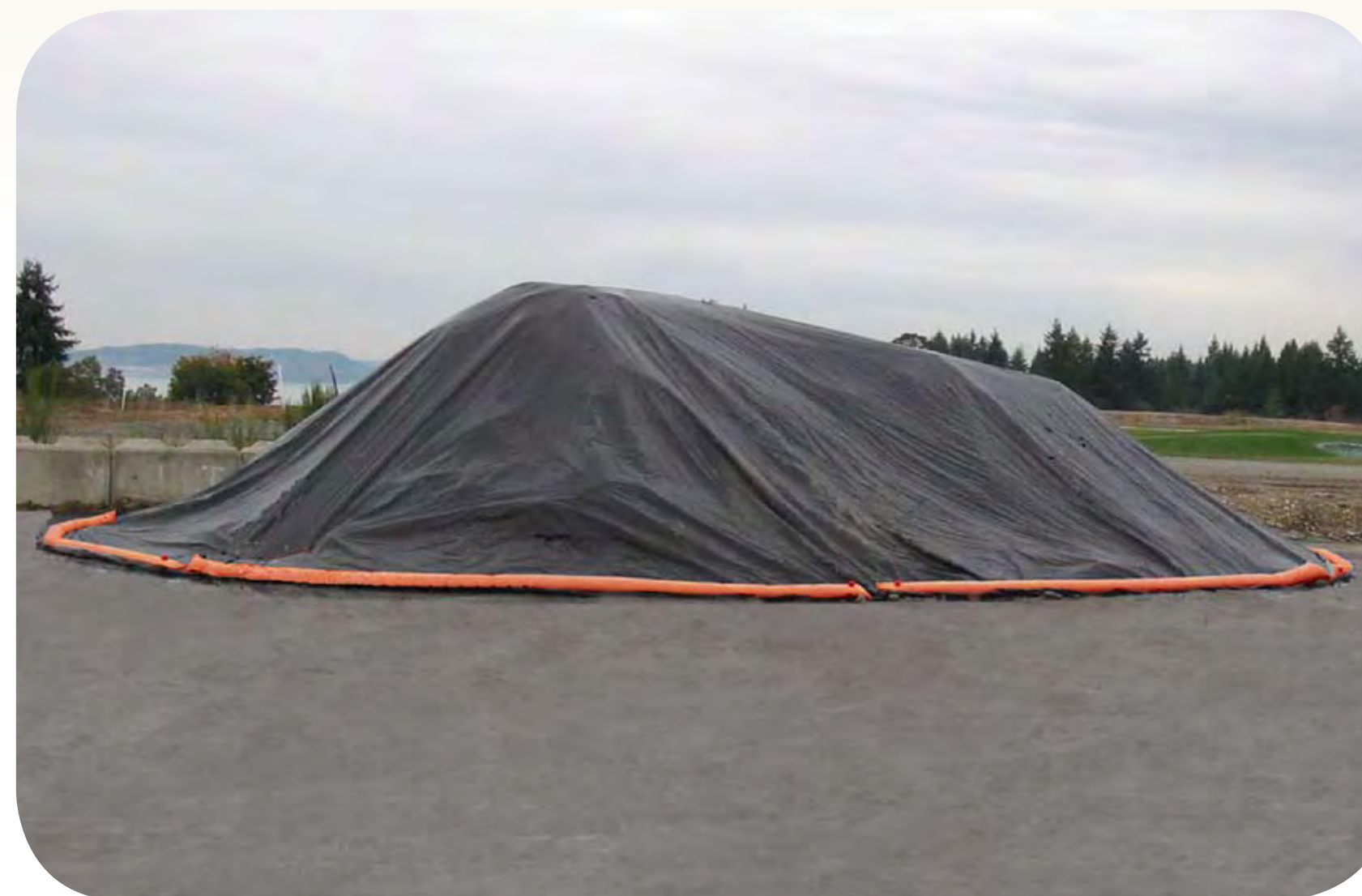
XR-5 Treated Bladder Haz Mat Spoil Pile