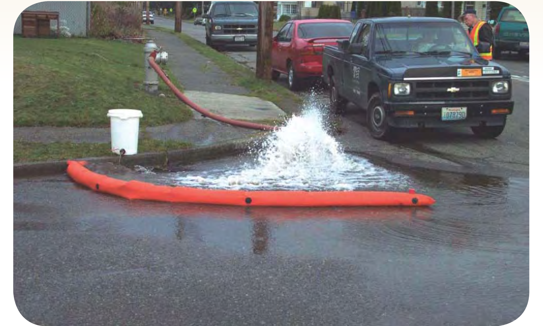
Quick Deployment Water Containment & Diversion