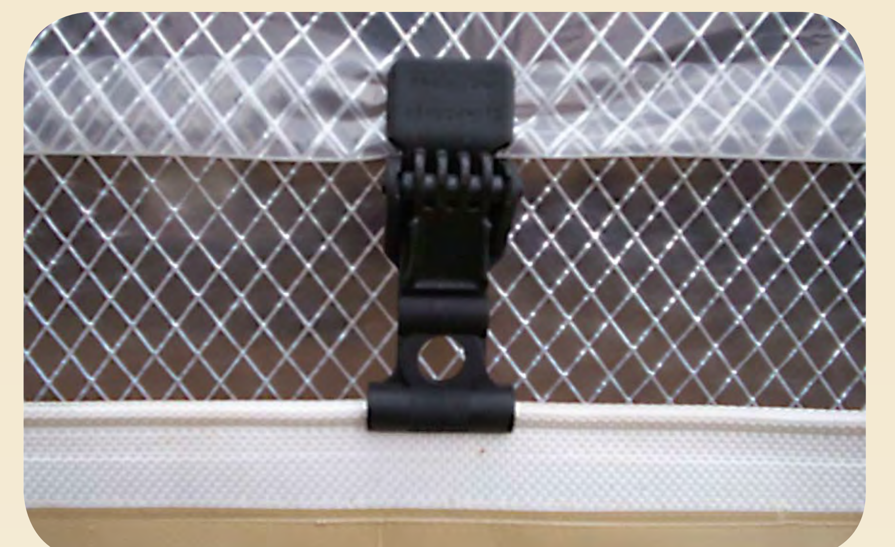
Clips to folded seam in reinforced Visquene to support a Water-fill Hanging Anchor

The Jaws Clip and the Water-Fill Hanging Anchor work as parts of a system that is both adaptable and effective.